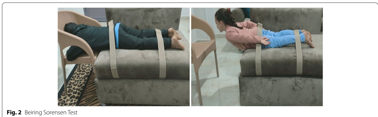
Fig. 2 Biering Sorensen Test