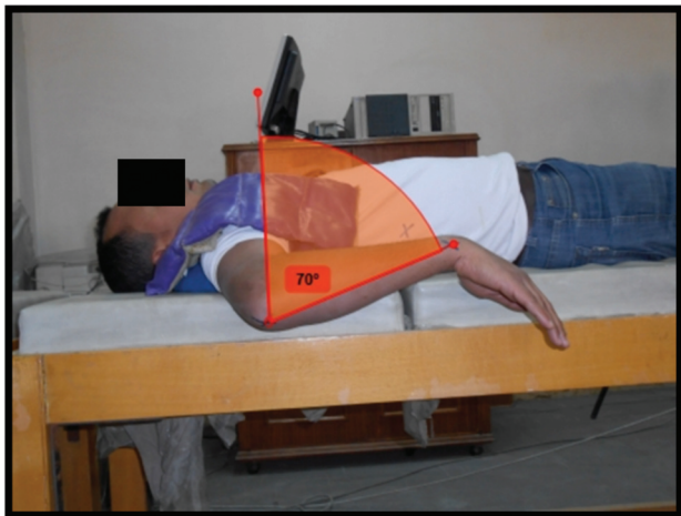
Analysis of shoulder internal rotation.