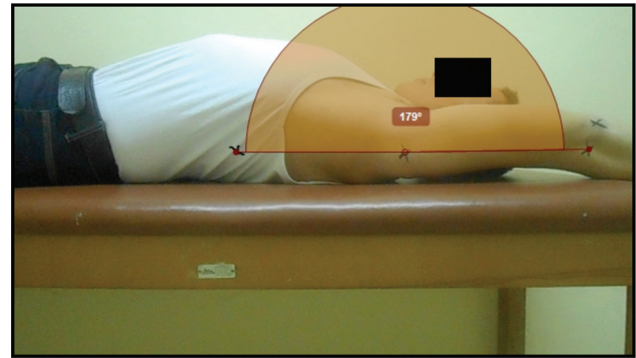
Analysis of shoulder flexion.