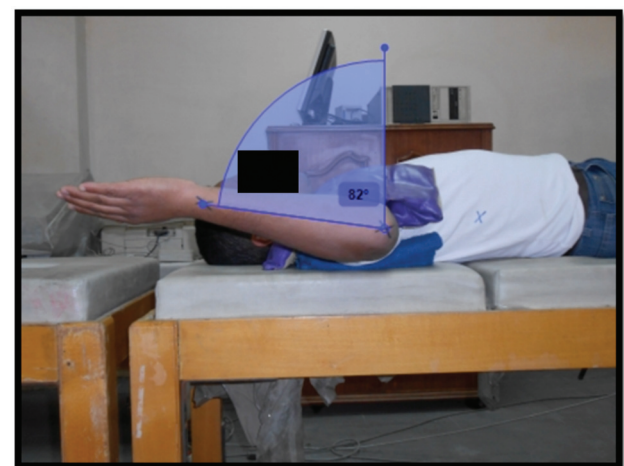
Analysis of shoulder external rotation.